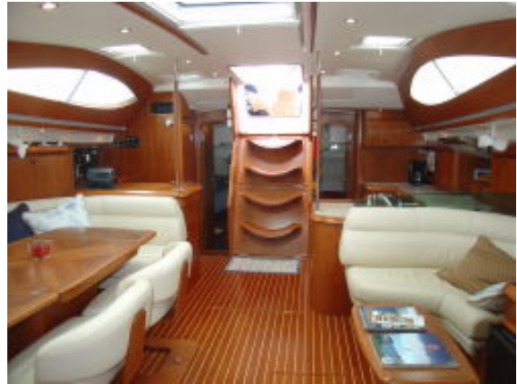
Main Salon Looking Aft