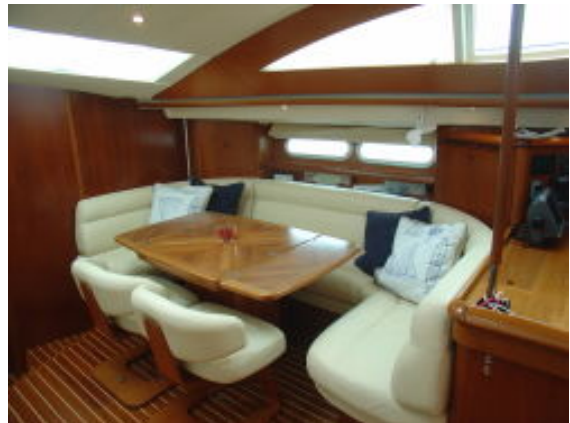
Main Salon Starboard Side