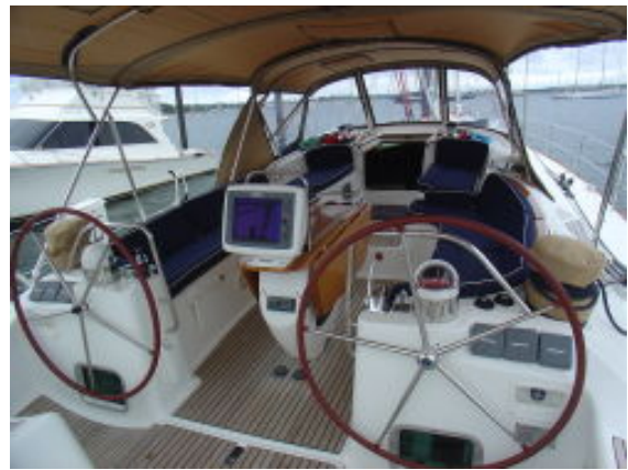
Twin Steering Wheels