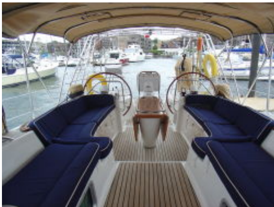
Cockpit with Split-level Seating