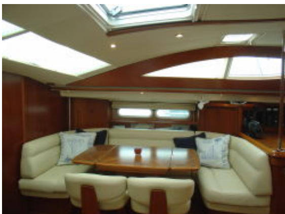
Light and Airy Main Salon