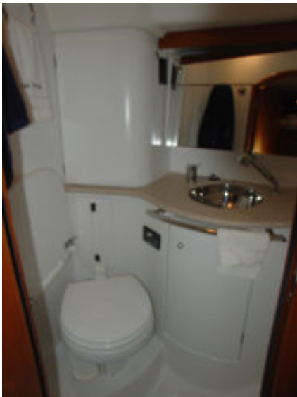
Starboard Guest Head