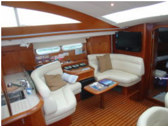
Main Salon Port Side