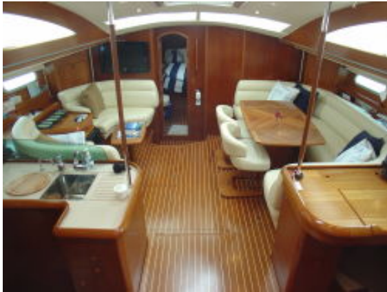
Main Salon Looking Forward