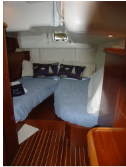
Starboard Guest Cabin