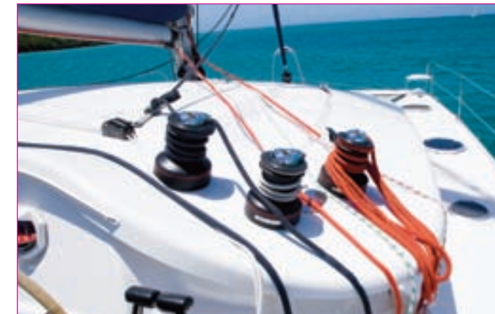
The deck plan is a success! The Orana can be handled singlehanded with no difficulty at all.