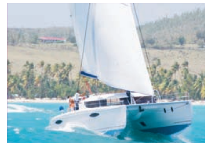
A top speed of 17.5 knots: this was the day's record!

Climbing aboard the Orana, we immediately felt perfectly comfortable. The volume, the available space, the ventilation and the light colours of the soft furnishings all combine to make