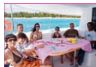
There is room for eight people around the cockpit table- ideal for welcoming friends...

to handle and harbour manoeuvres presented no problems: from the steering position, the view is excellent, both forward and aft. We just had to be wary of the high freeboard when climbing aboard after casting off the mooring lines... With 2 x 30 hp, the Orana quickly reached its cruising speed in satisfying silence. With the new deck plan, just one person can easily hoist the mainsail, whilst keeping the catamaran head to wind. The winches are of the right size, and the manoeuvre only takes a few minutes, with no great effort. From the steering position,