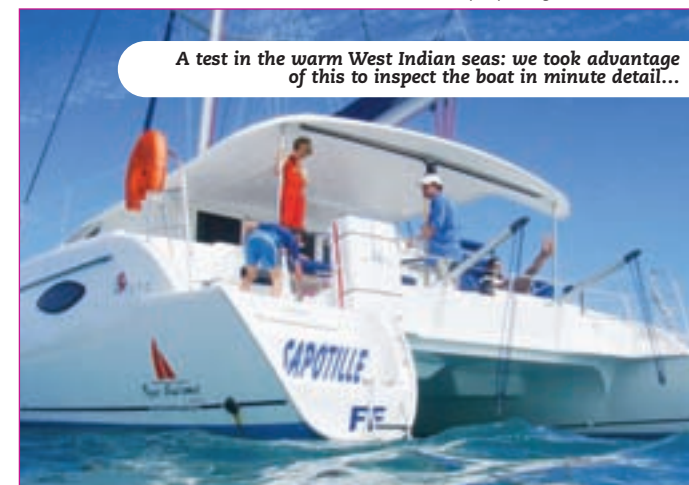
A test in the warm West Indian seas: we took advantage of this to inspect the boat in minute detail...

we unrolled the genoa and could at last stop the engines, to enjoy the Joubert-Nivelt designed hulls. This was the big surprise of the test: the Orana handles really well under sail. In the protected bay, on a perfectly flat sea, and with 15 knots of wind, the catamaran was quickly at 8 knots. With 20 knots of breeze, it remained at between 10 and 12 knots, with no need to play with the sail trim unduly. Don't forget that this boat was not new, its charter sails were already a good half season old and it was well laden... We can easily believe that with the new square-headed sails (CST) that the builder is preparing, the Orana will