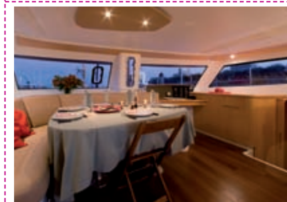
Inside, we find the atmosphere dear to this builder: it is comfortable, practical and pleasant to live in.