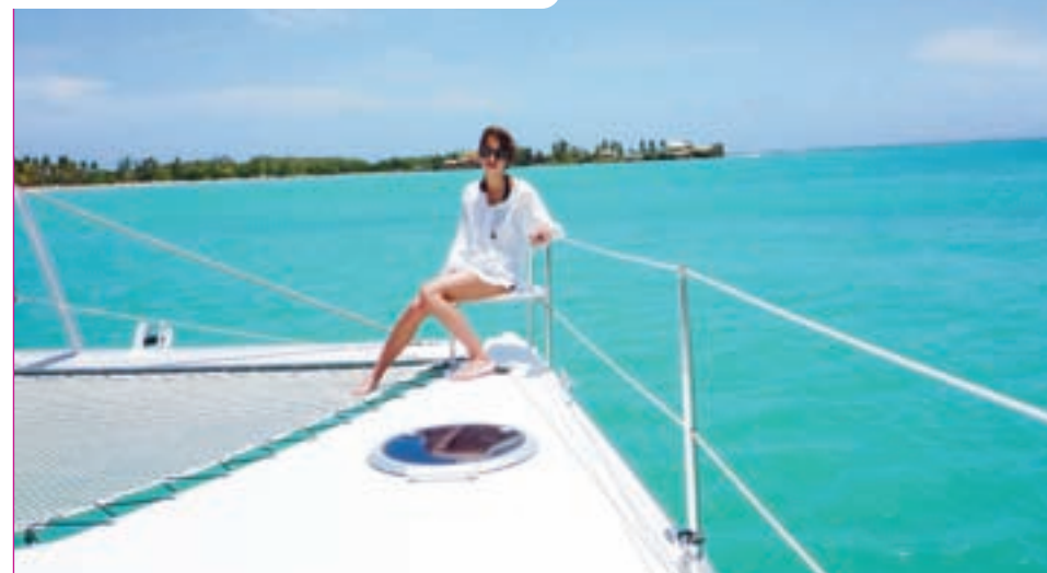
A catamaran which makes you want to go cruising...