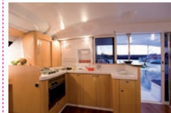
The galley is classic, however it is hard to wedge yourself in comfortably whilst sailing...