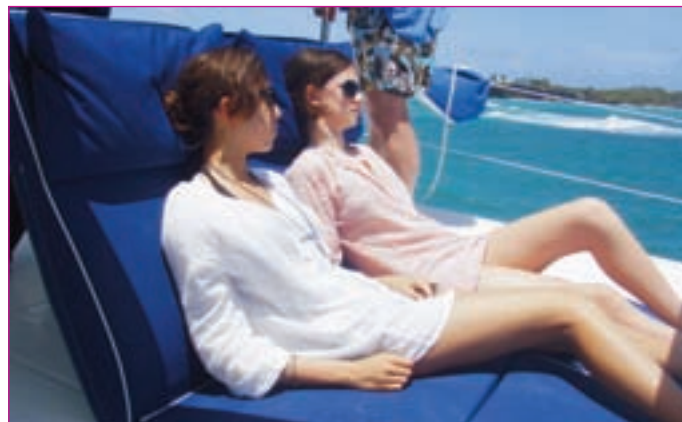
The sunbathing area situated just aft of the steering position is very pleasant, both at sea and at anchor!