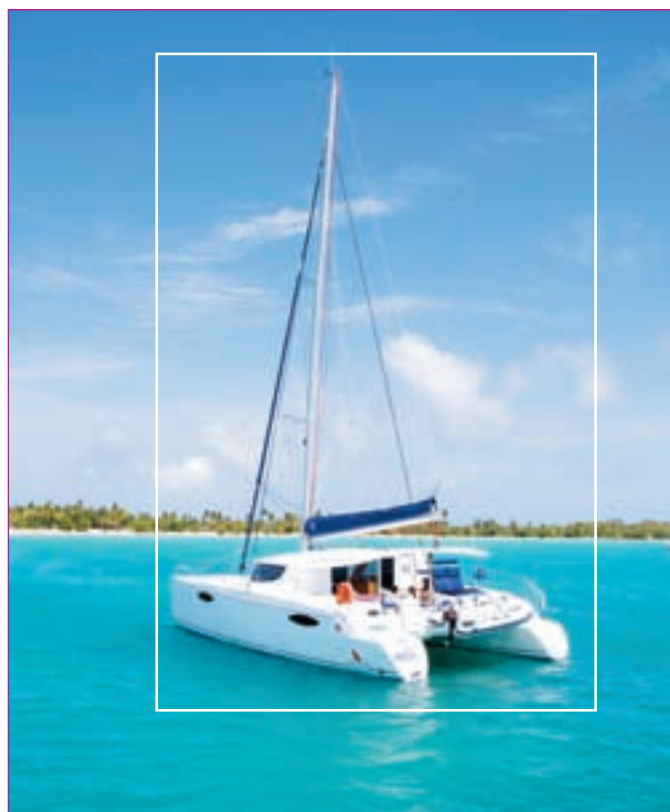
Martinique, the Salines beach: and exceptional place for this test of the Orana 44...

steering position (see below) and a great sunbathing area behind this steering position! Why great? Quite simply because this is the area that everyone fought over during our test day... It is comfortable, fun, and perfect for those who suffer from seasickness, or enjoy fishing, but has just one fault: it can't take everyone at the same time!