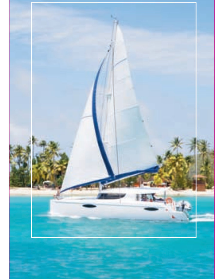
The Orana is a big boat with an imposing freeboard height, but its lines remain pleasant.

But the most important area aboard a catamaran is the cockpit, the favourite place during a charter cruise or a sabbatical year spent following the trade winds... And here, look out for your eyes! The builder has done a good job, with several areas: around the table, (which is classic and comfortable), the practical and pleasant seat/sunbathing area opposite, an XXL-sized