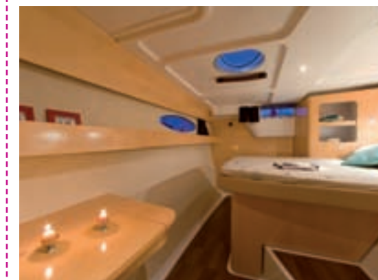
The cabins are very pleasant, especially with the wood colours chosen by the builder.