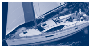
Sun Odyssey 45 DS Performance