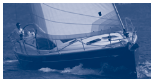
Sun Odyssey 50 DS