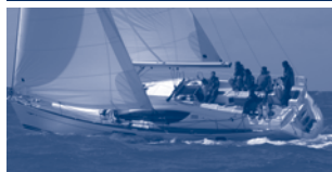
Sun Odyssey 45 DS